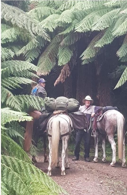
A forest of tree ferns in contrast to the dry stony ridges.