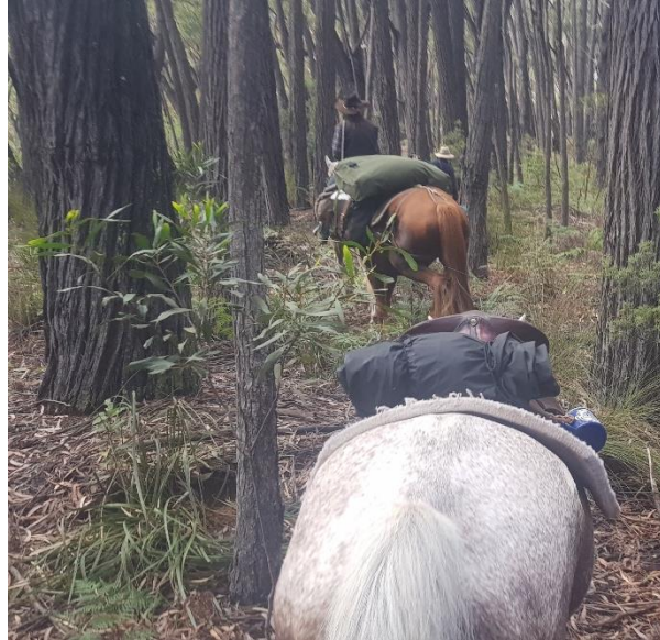
Descending the WD Tarlinton Track to Belowra.