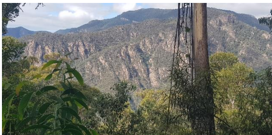
Wadbilliga National Park- spectacular rocky ridges.