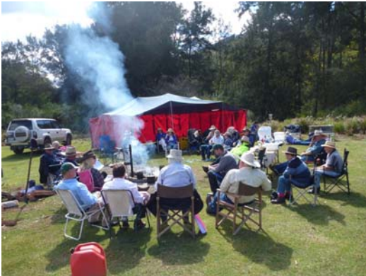
The Meeting in progress.

Our newly appointed secretary, of the younger generation, was so impressed with the experience of riding to the