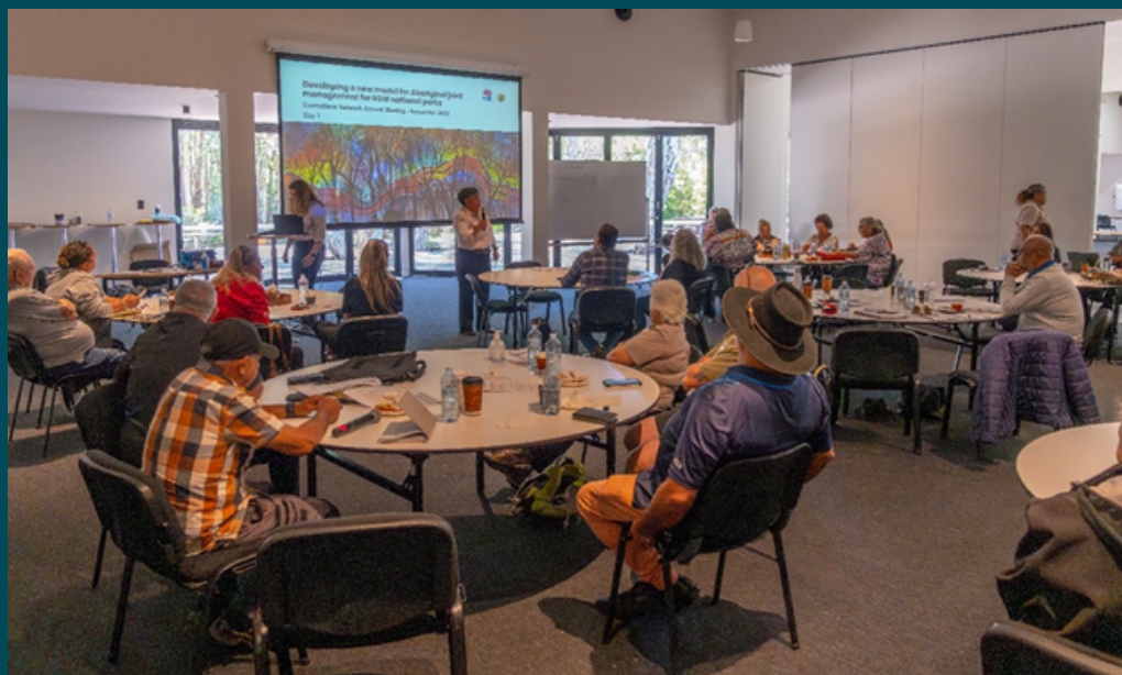
Participants at the AJM workshop during the Custodians Network Meeting at the Murrook Cultural Centre, Worimi Country