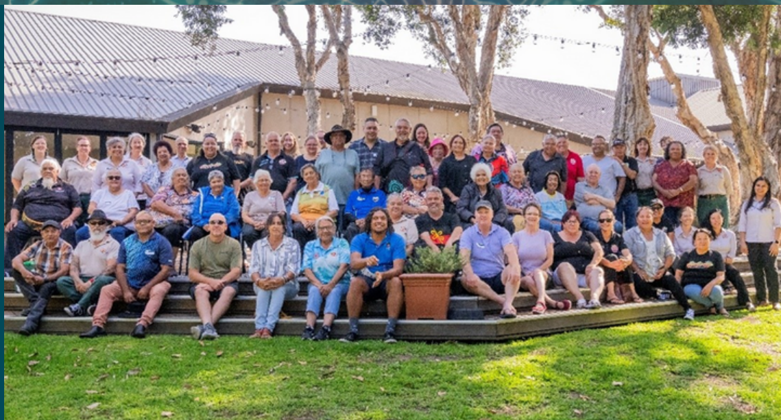
Members of the NPWS Custodians Network with the NPWS staff during the Custodians Network Meeting at the Murrook Cultural Centre in Williamtown, Worimi Country