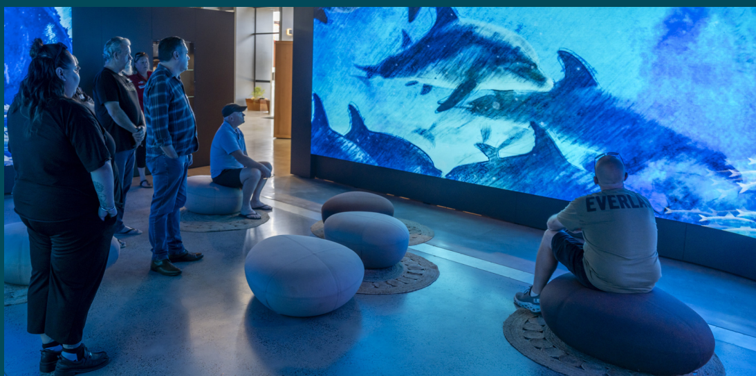
Members of the NPWS Custodians Network admire an art installation at the Murrook Cultural Centre in Williamtown, Worimi Country