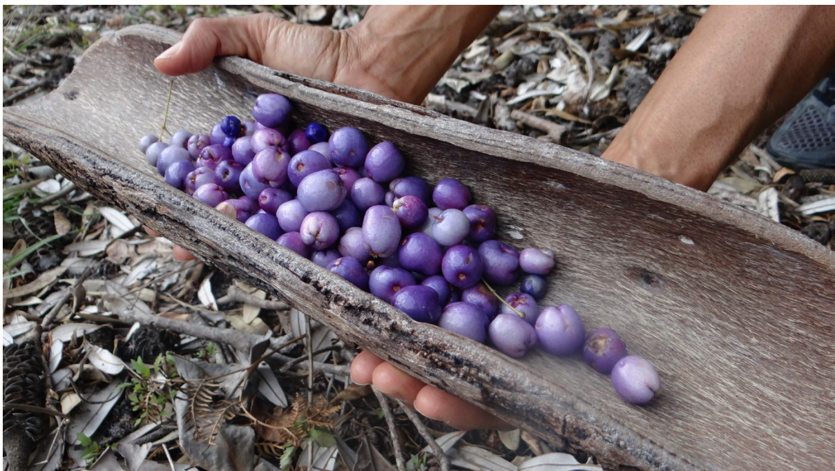
Photo Arakwal Aboriginal Bush Tucker, Arakwal National Park.