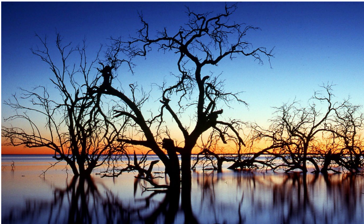
Sunset over Menindee Lake in Kinchega National Park.

Current joint management arrangements will remain in place whilst a new model is being developed.