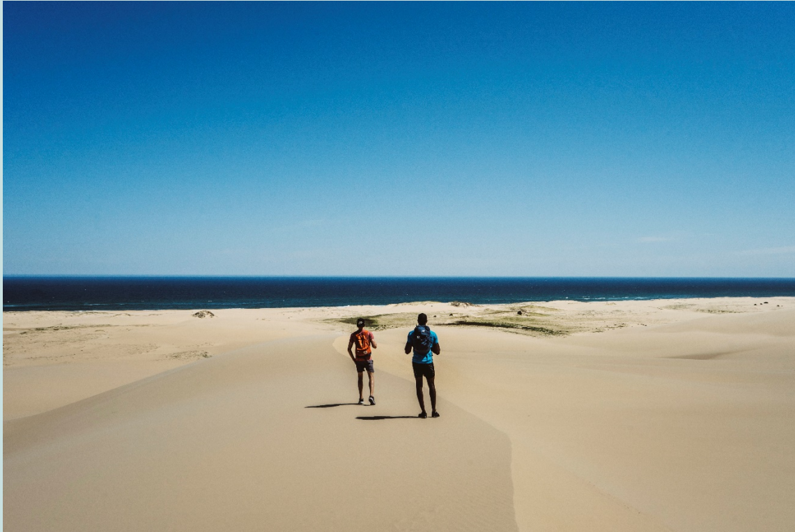
Photo Stockton Beach, Worimi Conservation Lands.

The Worimi Conservation Lands employ 19 Aboriginal people, with plans to increase this number to 26 during 2022–23. The arrangements at Worimi Conservation Lands have helped support the development of an associated eco-tourism business owned and run by Worimi people. Land management contractors working on Worimi Conservation Lands also employ Aboriginal people. The Worimi Local Aboriginal Land Council holds a Parks Eco Pass and conducts tourism ventures both on and off park.