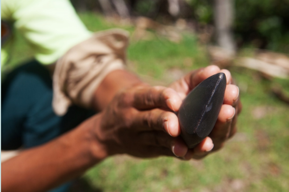
Photo Dolphin Dreaming Discovery program, The Pass, Arakwal tools.

Joint management agreements provide for Aboriginal people to have primary responsibility for the assessment, management, monitoring, protection and interpretation of Aboriginal cultural heritage. The Board of the jointly managed Mount Grenfell national park is working with Heritage NSW to undertake an audit of its art sites. Worimi Conservation Land Board and the Narran Lakes Joint Management Committee have climate change adaptation projects raising awareness of threats to cultural heritage and detailing the practical actions required to safeguard Aboriginal cultural heritage for future generations.